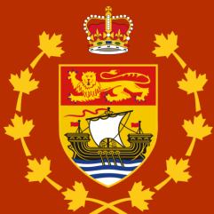
Crest of the Lieutenant Governor of New Brunswick

The Act in question, which was passed in 2013 in collaboration with Commonwealth governments across the globe, came into effect on March 26th of this year. It removes the impediment to Roman Catholics as well as male primogeniture, which means that females and males have equal rights to the Succession. Although this aspect of the Act is less known, it also replaces the Royal Marriages Act, 1772, which required all descendants of George II to obtain the Sovereign's permission to marry.