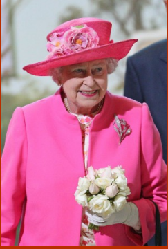
Her Majesty The Queen

Since our last newsletter, the Canadian Monarchy has been very much in the news. Firstly, there was the rather tedious legal case about the Oath of Citizenship which has been a drain on the public purse for, these many years.