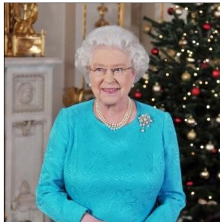
Her Majesty the Queen delivers her Christmas Broadcast, 2009

For those of you looking for ideas on how to please a family member or friend with the perfect Christmas gift, why not consider giving