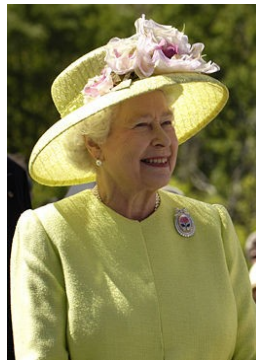
Her Majesty the Queen

PM, during which members and guests will be given the opportunity to mingle and enjoy some refreshments. Meanwhile, a silent auction will be held. If any members have items they wish to do-