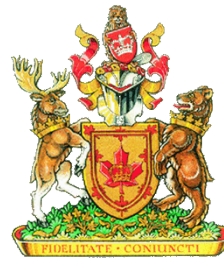
Arms of the Monarchist League of Canada, as approved for our use by Her Majesty the Queen.

Boasting over 17,000 members across the nation, the League