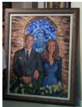
This 2/3 lifesize portrait of the Duke and Duchess could be yours!

- Members of the Branch have been offered the chance to purchase a portrait (below) of