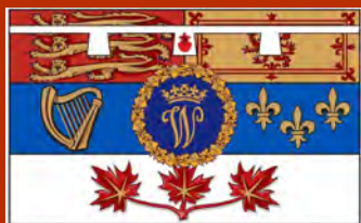
THE PERSONAL FLAG OF THE DUKE OF CAMBRIDGE FOR USE IN CANADA LE DRAPEAU PERSONNEL DU DUC DE CAMBRIDGE UTILISÉ AU CANADA