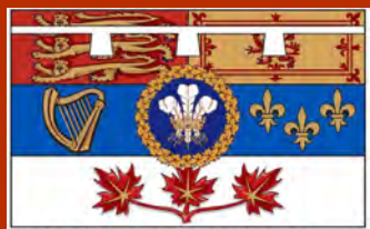
THE PERSONAL FLAG OF THE PRINCE OF WALES FOR USE IN CANADA LE DRAPEAU PERSONNEL DU PRINCE DE GALLES UTILISÉ AU CANADA

On Canada Day, the Canadian Heraldic Authority unveiled newly designed personal flags for use in Canada by the Prince of Wales and the Duke of Cambridge. This unprecedented move would