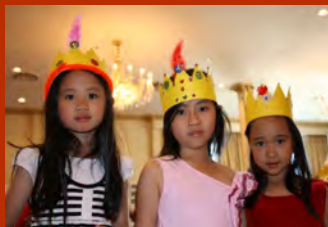
These three young ladies were among the 100+ children who attended our 'Royal Party'

We were honoured to have been given the chance to witness this historic royal milestone and shall never forget all that we saw and took part in. God Save the Queen!