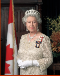
Her Majesty The Queen

This September 9th, our Queen will reach an historic milestone. On that day, she will surpass her great-great-grandmother, Queen Victoria, to become the longest-reigning Sovereign in modern Canadian history. No British Sovereign has ever reigned longer.