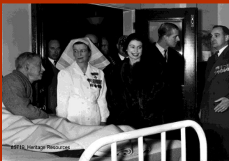
The Queen and Prince Philip in NB in November 1951

By now, you have likely received two books of tickets to sell in support of our annual fundraising raffle. This is, as you know, the Branch's major source of revenue for the year.